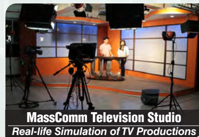
MassComm Television Studio Real-life Simulation of TV Productions