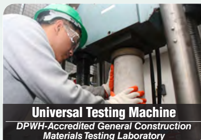
Universal Testing Machine DPWH-Accredited General Construction Materials Testing Laboratory