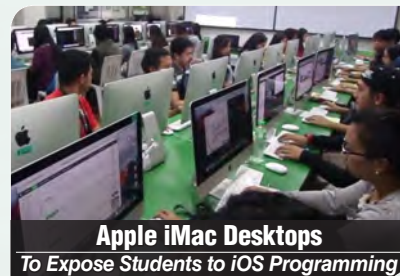
Apple iMac Desktops To Expose Students to iOS Programming