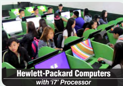
Hewlett-Packard Computers with 'i7' Processor