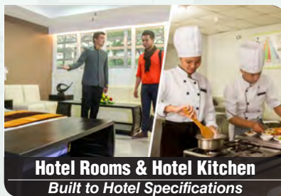
Hotel Rooms & Hotel Kitchen Built to Hotel Specifications