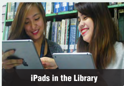
iPads in the Library