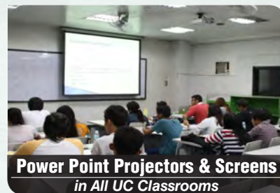
Power Point Projectors & Screens in All UC Classrooms